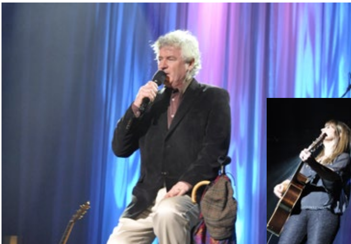
▲ Scottish-Canadian tenor John McDermott ▶ Country superstar Michelle Wright

Information on specific dates and locations can be obtained from the CSANews magazine, by visiting the CSA website www.snowbirds.org , or by calling the CSA office at 1-800-265-3200 .